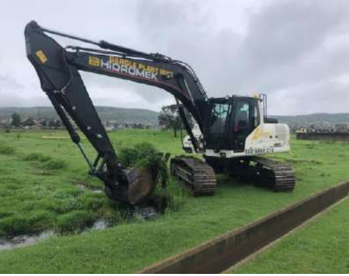
CLEARING OF POND 1