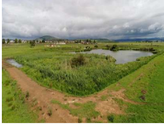
CLEARING OF POND 1 AND POND 2