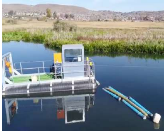
LARGE DREDGER AGITATING ON POND 3