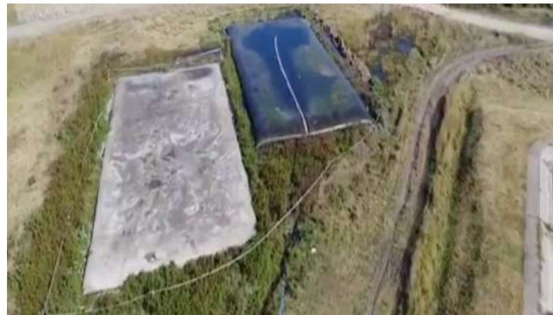
DE-WATERING BAGS AT PROJECT COMPLETION