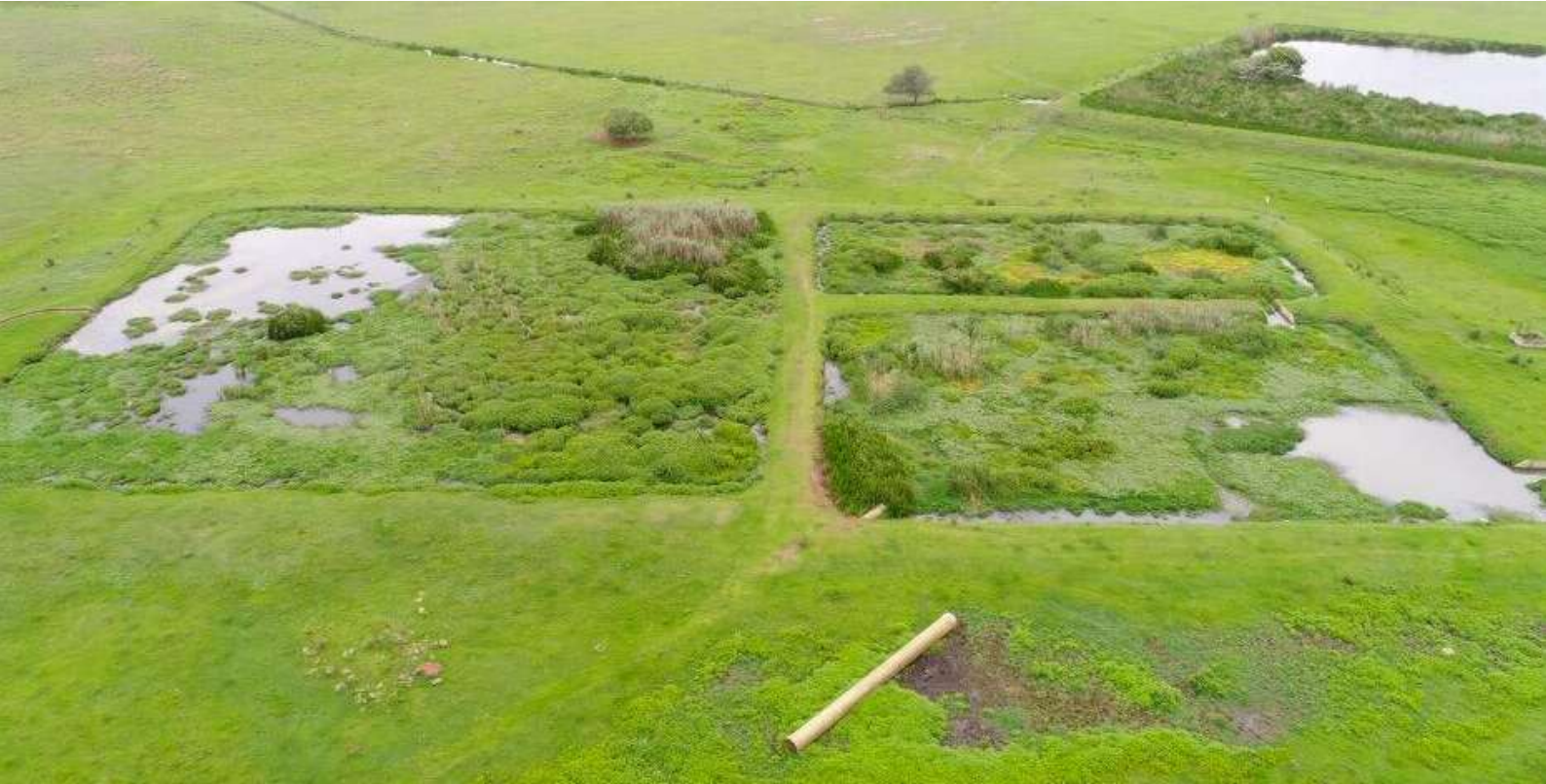
PONDS AT THE START OF THE PROJECT