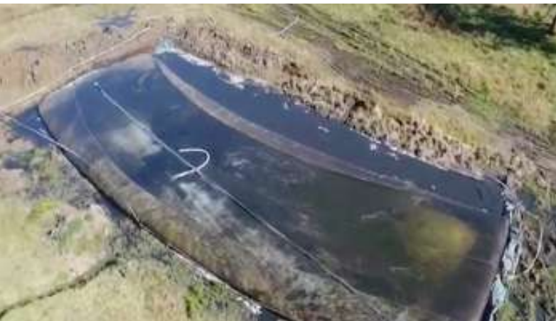
LARGE DE-WATERING BAG AT PROJECT COMPLETION