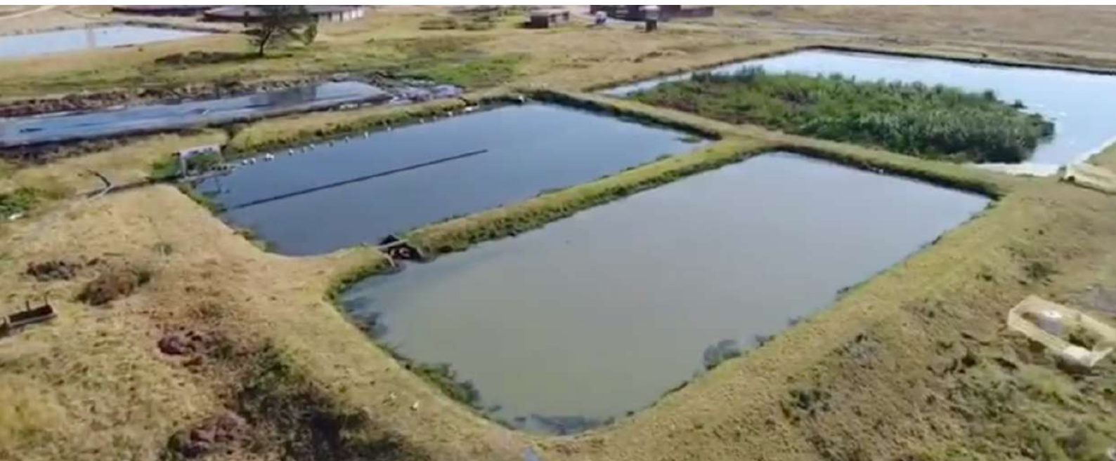
POND 1 AND POND 2 AT PROJECT COMPLETION