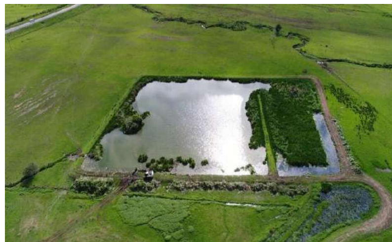
ON-GOING CLEARING OF POND 1 AND POND 2