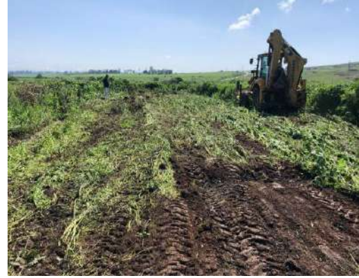
PREPARATION OF DEWATERING BEDS