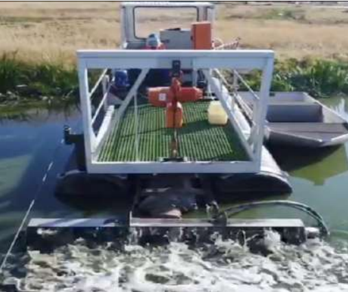
LARGE DREDGER ON POND 3